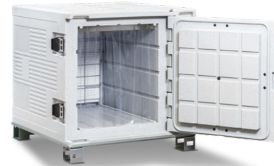
330L XF model

C = Cooling - F = Freezing - H = Heating - HF = Freezing & Heating - XF = Freezing -30°C Ambient temperature range: -10°C to +50°C