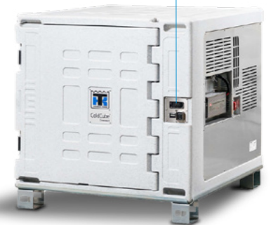
330L FLEX model