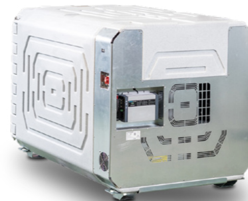
720L FLEX model